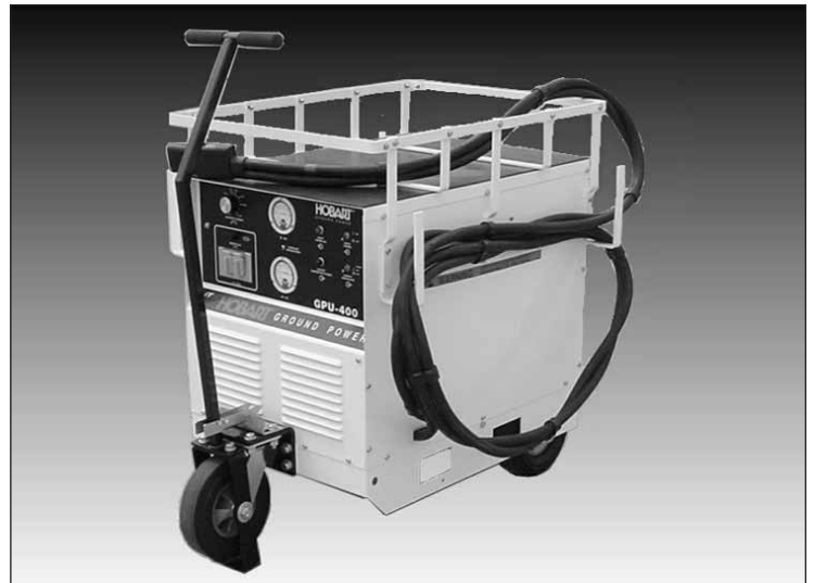
(shown with optional Cable Tray Kit)

Hobart GPU-400 and GPU-600 Solid State ground power units provide precisely regulated 28.5 volt DC service with minimum noise. These reliable solid state GPUs are equipped for engine starting in the current limiting “soft start” mode recommended by most airframe manufacturers. Specifically developed in response to customer needs, the GPU-400 and GPU-600 supply the fully regulated, dependable power required by today’s more demanding aircraft. The GPU-400 delivers 400 amperes continuous to 1600 amperes peak for starting, and is available with a 14.25 volt DC option. The GPU-600 delivers 600 amperes continuous to 2000 amperes peak for starting. Hobart GPU-400 and GPU-600 Series units . . . reliable power for your aircraft.