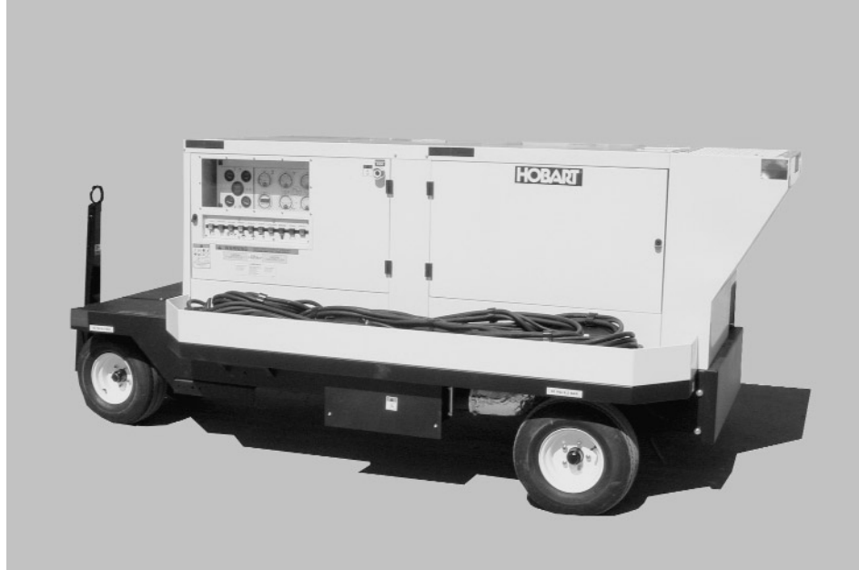
Note: Shown with optional Transformer-Rectifier pack for 28.5VDC