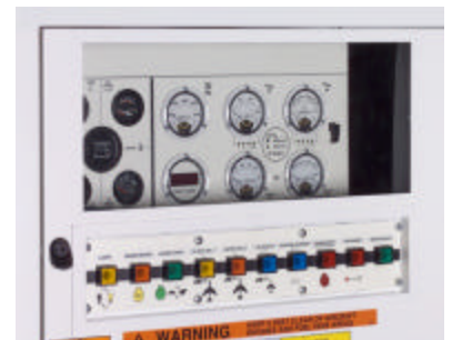
Operator Control Panel

Hobart International (UK) • Phone: 44-1723-370437 • Fax: 44-1723-370125